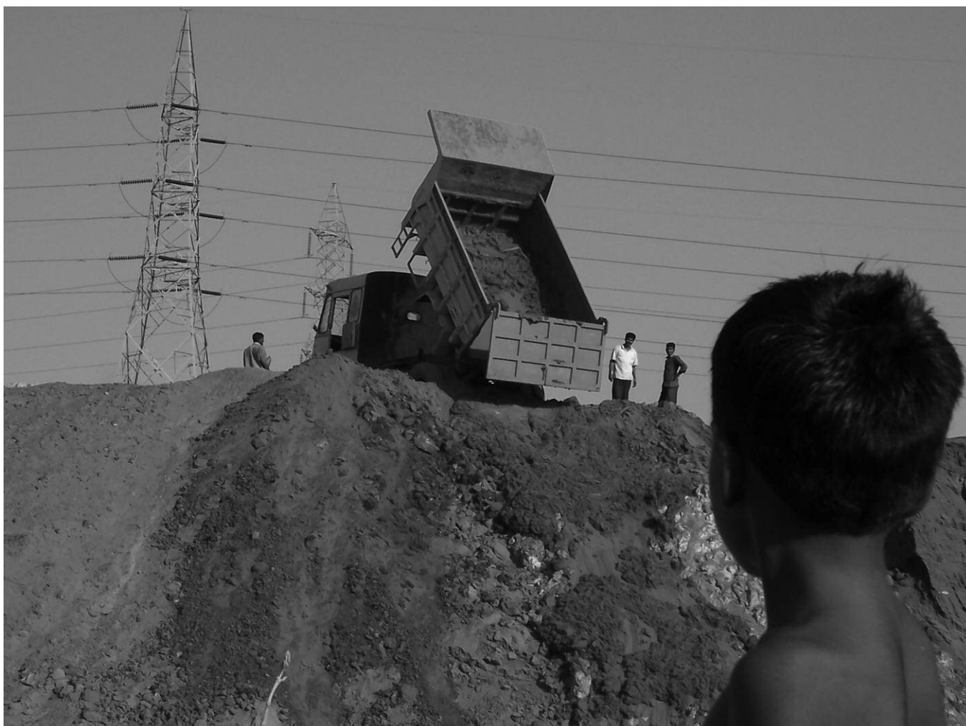
A child observing red mud being dumped near the Stanley Reservoir, at Mettur.