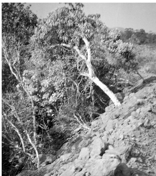
An un-reclaimed pit and waste rock dump belonging to Vedanta just above farm land in the Kolli Hills, Tamil Nadu