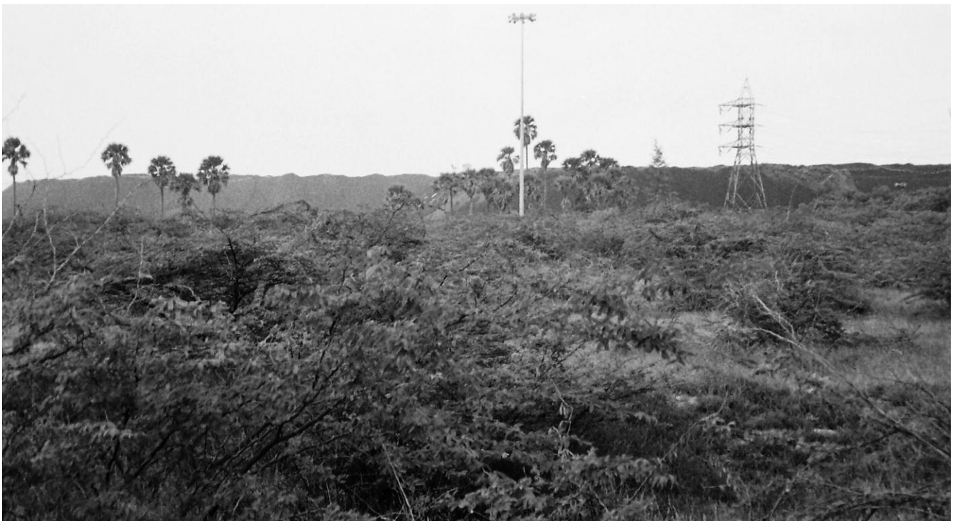
Thousands of tonnes of arsenic-laden slag, open to the wind, visible behind scrubland at the Tuticorin smelter (April 2005).

From: Show Cause Notice to Sterlite Industries, Tuticorin, April 2005