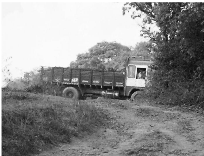
A Vedanta truck leaves the Balmadies coffee plantation, uncovered and spraying silica-laden bauxite dust on children returning from school.

Exasperated by these procrastinations and Vedanta's illegal actions, in late July 2005 the SCMC drafted an order to shut down the smelter for "fully violating the Hazardous Waste Rules 1989 and the order of the Apex court dated 14-10-2003 and the consent of the Tamil Nadu Pollution Control Board (TNPCB)."