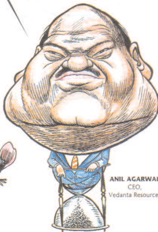
ANIL AGARWAL CEO, Vedanta Resources