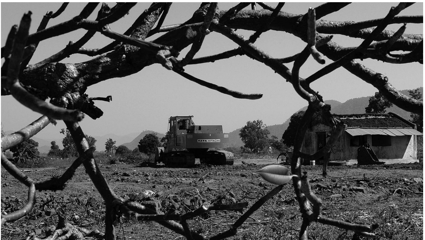
Not so long ago there were people in Kinari. Now it is part of Vedanta's Lanjigarh refinery

As confirmed in a July 2005 study by The Environment Protection Group Orissa (EPGO), the entire Nyamgiri deposit lies atop of a protected forest area which is home to a variety of rare and threatened fauna and flora. Their diversity is scarcely equaled in the rest of south Asia and includes thirty medicinal plants, at least fifteen kinds of epiphytic orchid, twenty wild ornamental plants, more than ten kinds of wild relatives of crop plants (including some protected under an international undertaking), tigers, leopards, elephants, sloth bears, palm civet, and other animals, many of which are listed as endangered by the International Union for the Conservation of Nature (IUCN). There are also rare birds, the unique Golden Gecko lizard and wild snakes including a rare type of viper.*